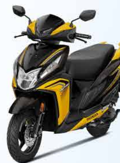
PEARL SPORTS YELLOW